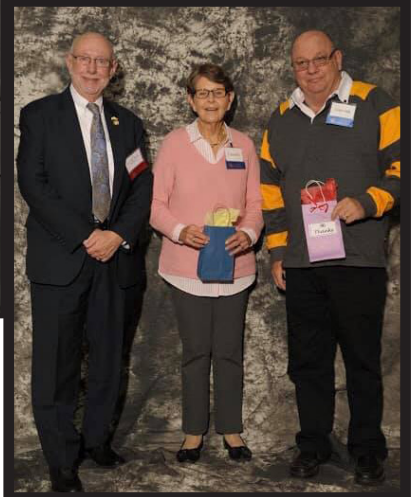
Here are photos from the recent Celebration of Schools program hosted by the Southwest Center for Educational Excellence recognizing innovative educators, school board members and school districts. If you are friends with any of the educators in these photos feel free to share them.