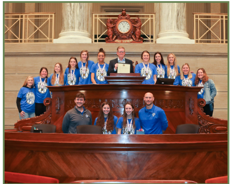
State champion Boonville High School girls basketball team with Sen. Rowden.