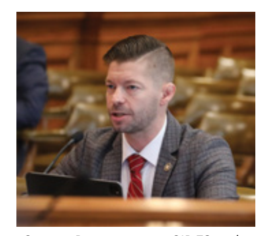
Senator Brown presents SJR 78 to the Senate Local Government and Elections Committee.

The new law also includes language that aligned the Missouri Constitution with state statute by specifying only citizens of the United States are eligible to vote in elections. I appreciate the support of those who helped put this important measure in front of voters.